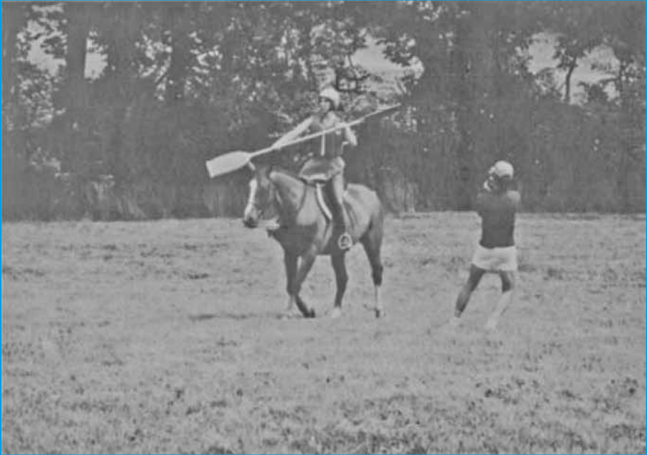
The "Kayaking in the Bluegrass" slide presentation brought the house down

A tongue-in-cheek view of rafting showed the dreams that a professional guide might have. A slide show on hypothermia presented valuable information in an interesting concise way. "El Horrendo", showing a hair run-down the Russell Fork in Kentucky had a wonderful sound track that included "Pomp and Circumstance" as the victorious paddlers made it off the river. An instructional film on basic kayaking technique starred a horse instead of a kayak, and brought down the house with its ferry and roll.