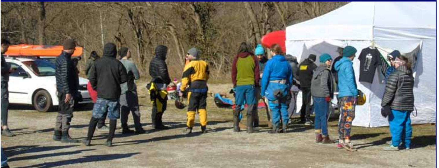
2022 Jess Cup Race Sign In